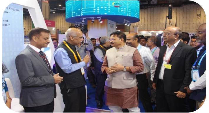
Visit by Hon’ble MoSC

TEC participated in IMC with the broad objectives (i) to showcase TEC Standards/ Guidelines, Processes, Certifications etc (ii) communication & Outreach with industry in general and special emphasis on Startups, innovators, MSMEs etc. to understand their needs (iii) to promote standardization in the sector (iv) to explain enabling policies/ scheme of Government viz. PLI, PPP-MII, DCIS etc and (v) to understand ongoing technological advancements and product/ services development and aligning TEC standard formulation agenda/ programme with it.