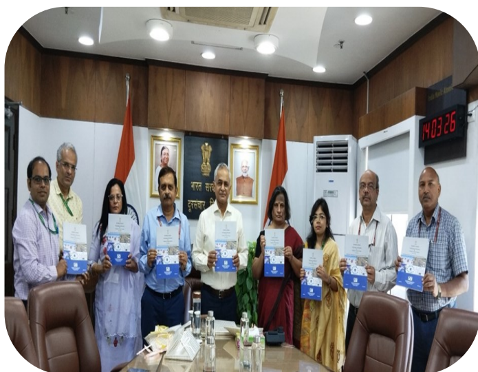
Release of TEC Technical Report on Technologies and Standards for Intelligent Transport System on 19th October 2023 by Secretary (T), DoT

This Technical Report is based on the study of national / international standards and guidelines released by ITU, 3GPP, APT, IEEE, ETSI, ISO/ SAE, 5GAA etc. and has elaborated the technologies and standards for the development of Intelligent Transport System. It has also covered the use cases and trials in India and abroad. The recommendations available in this report related to standards, spectrum and security aspects, will be a good reference for the related stakeholders in developing the eco-system for the automotive sector.