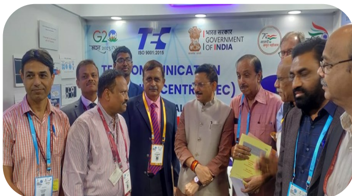
Visit of TEC Stall by Shri Devusinh Chauhan, Hon’ble Minister of State for Communications

The Secretary (Telecom) while visiting the TEC stall appreciated the efforts of TEC and asked TEC for assessment of present Lab capacity and enhancing Lab eco-system, enhancing IOT manufacturing and utilizing IOT in driving Industry 4.0.