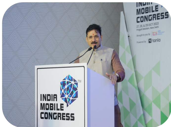
Shri Devusinh Chauhan, Hon'ble MoSC