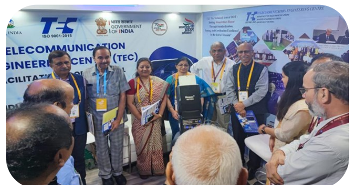
Visit by Member (S), DCC, Member (T) DCC and DG Telecom, Dept. of Telecom

The Secretary (Telecom) while visiting the TEC stall appreciated the efforts of TEC and asked TEC for assessment of present Lab capacity and enhancing Lab eco-system, enhancing IOT manufacturing and utilizing IOT in driving Industry 4.0.